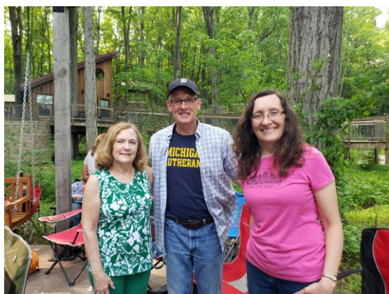
"Smores with the Bishop"

The office will be Closed June 1 & 2, and July 3 & 4