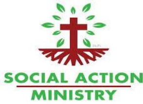
SOCIAL ACTION MINISTRY