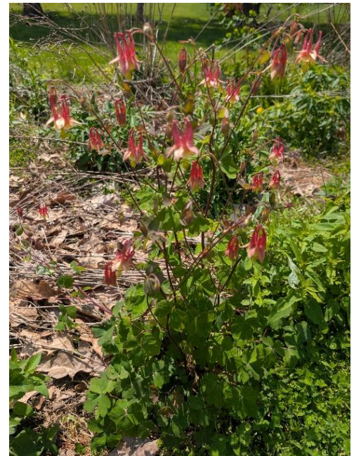
Eastern Red Columbine